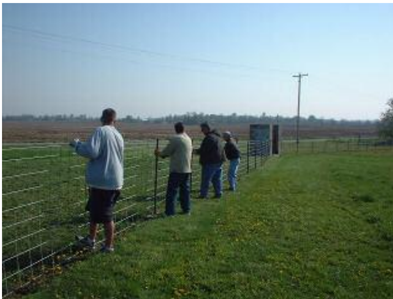
Many hands help put up new fencing on "Field Maintenance Day"