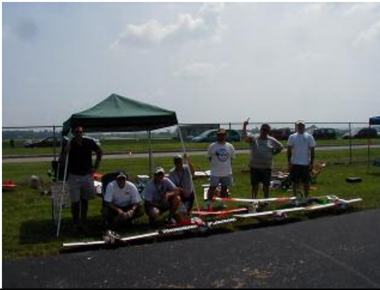
Your 2003 Hamilton County R/C Fliers City-Wide Fun Fly Team